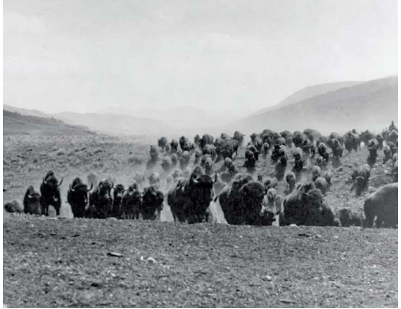
Pte-O-ya-te, the Buffalo People, or Buffalo Nation, 1917. The Lakota considered bison to be relatives, who provided humans with food, clothing, shelter, tools, medicine, and many other necessities.

The traditional culture of the Lakota was changed by the westward expansion of the United States and the decimation of the bison. The people could no longer engage in the communal work of hunting and preparing the different parts of the animal for food and other uses. Because they have a rich ceremonial and community life that has formed over thousands of years, the Lakota have been able to continue as a unified people. Lakota stories, prayers, songs, dances, and celebrations still honor the bison.