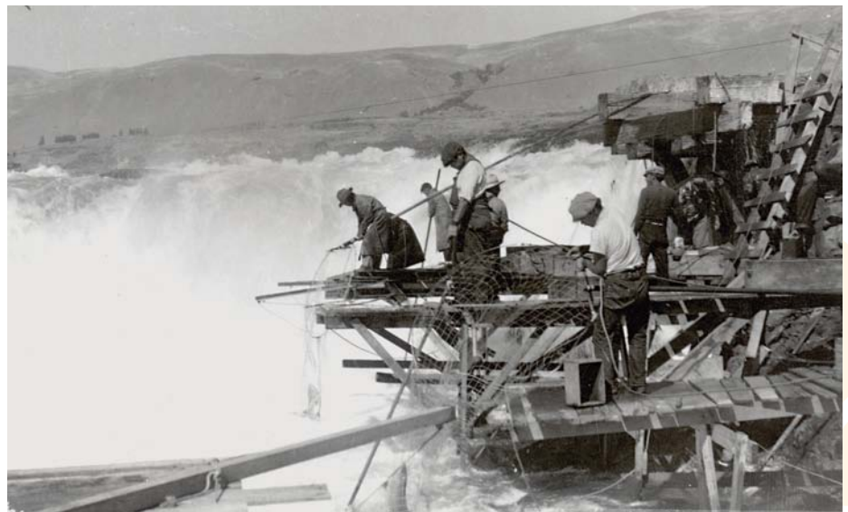
Salmon were once plentiful at Celilo Falls on the Columbia River, but the falls were flooded by the construction of The Dalles Dam in 1957. Today, Yakama fishermen cannot harvest salmon from this traditional fishing location.

Today, because of overharvesting and the effects of the Columbia River’s many hydroelectric dams, fewer and fewer salmon complete their upstream journeys, and salmon populations have dramatically declined. The people are involved in efforts to restore the salmon and, with them, the Yakama community and culture.