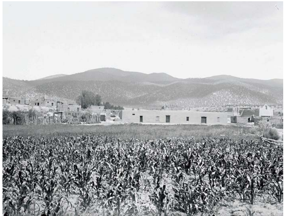
Picuris Pueblo, New Mexico, where the average annual rainfall is about 14 inches. Photo by Adam Clark Vroman, 1899. Courtesy of the National Anthropological Archives, Smithsonian Institution

Traditionally, being a responsible caretaker in this type of mutual relationship has meant respecting nature’s gifts by taking only what is necessary and making good use of everything that is harvested. This helps ensure that natural resources, including foods, will be sustainable for the future. In this way of thinking, the Diné, or Navajo, believe that people should live in a state of balance or beauty within the universe. This state of balance is called hozho in the Diné language.