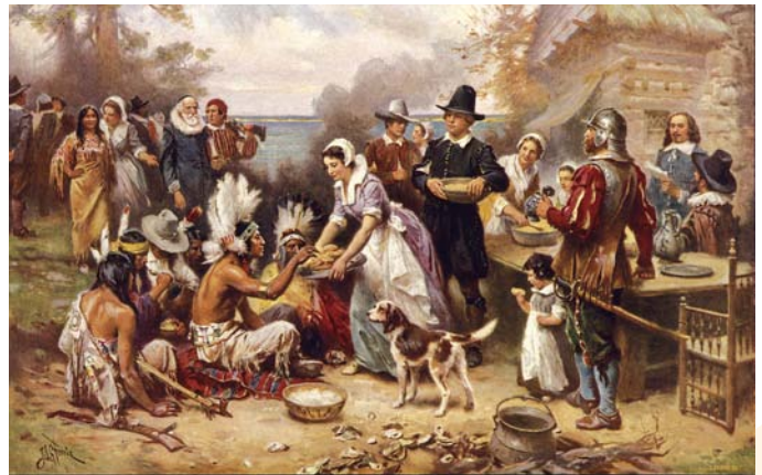
The First Thanksgiving 1621 J. L. G. Ferris.

In this poster, we take a look at just a few Native communities through the prism of three main themes that are central to understanding both American Indians and the deeper meaning of the Thanksgiving holiday. The themes are: