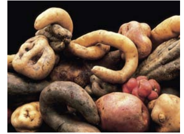
By the 1500s, indigenous Andean farmers had developed more than three thousand varieties of potatoes.

America's first people understood that even plants can work better together than apart. Haudenosaunee and other Native peoples introduced Europeans to techniques of companion planting—growing plants that complement each other in the same plot of ground. Corn, beans, and squash are especially suited to the companion planting technique. Beans climb the tall, strong corn stalks and replenish the soil with nitrogen. The corn's leaves protect the beans from the sun. Squash planted between the corn plants holds moisture in the soil and discourages weed growth and insect infestations. Known by the Haudenosaunee as the Three Sisters, corn, beans, and squash form an important part of many Native peoples' traditional diets.