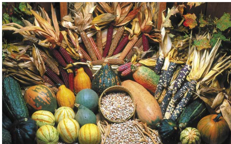
Some of the food plants that the Haudenosaunee give thanks for are corn, beans, and squash.