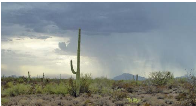
Summer in southern Arizona and northern Mexico brings extreme heat and life-sustaining rains.

As in many Native communities during the past sixty years, processed foods high in sugars began to replace locally grown foods, and a more sedentary lifestyle developed when traditional forms of exercise and work became unnecessary. This change in diet and lifestyle has led to a high incidence of diabetes and other health problems. In response to the health crisis, the O'odham are working to grow and market their traditional foods through an organization called Tohono O'odham Community Action (TOCA). TOCA is dedicated to