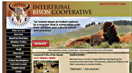
Home page of the InterTribal Bison Cooperative's website. Bison is tasty and healthy meat.

promoting better health, perpetuating cultural traditions, and creating economic opportunity through two farms that sell traditional O'odham foods. Returning to these traditional food practices supports the O'odham community and enables them to use their environment as their ancestors did. As diabetes and other health problems affect more and more people worldwide, many could benefit from traditional O'odham and other American Indian foods and diets.