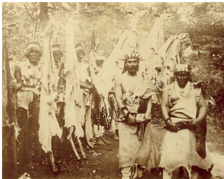
Hupa White Deer Dancers, ca. 1895.

Ultimately, American Indian peoples' connection to place is about more than simply caring for the environment. That connection has been maintained through generations of observation, in which people developed environmental knowledge and philosophies. People took actions to ensure the long-term sustainability