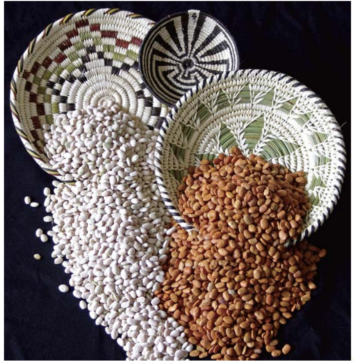
White and brown tepary beans with traditional Tohono O'odham baskets.

Even so, Native American contributions continued to be essential to the survival of Europeans. If not for the generosity and knowledge of the Native peoples who met the explorers Lewis and Clark during their travels in the Northwest from 1804 to 1806, their expedition probably would have ended in disaster. Ultimately, Native encounters with Europeans resulted in the loss of entire Native communities, traditional ways of life, indigenous knowledge, and access to foods that had sustained Native people for thousands of years. War, genocide, disease, dispossession of lands, and ill-conceived federal policies profoundly affected American Indian communities and their environments. The consequences are still felt today. Overharvesting, pollution, and reduction of wilderness habitats have also had an effect on the ability of Native people to grow, gather, or hunt their traditional foods. As they look for ways to keep their cultures alive and to address modern economic and health issues, many Native communities are taking steps to revive their traditional food practices.